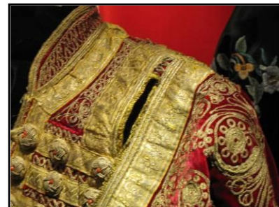
Lush floral motifs on this heavily beaded bandalier bag (left), are the work of a Native American artist of the Northeastern woodlands. The ornate bolero matador's jacket (circa 1940) is from Spain. (Donors: C.P. Reissaus, N.B. White)