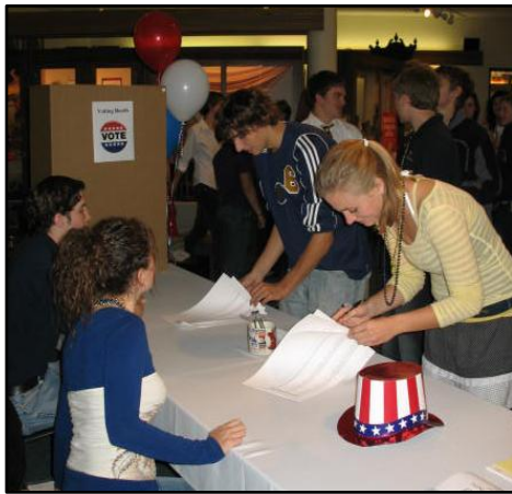
Upper School students sign registration lists before casting their ballots.