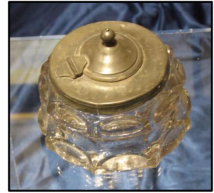
Lincoln ink well