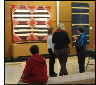
Exhibit Opening: Weaving in the Southwest tradition.