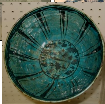
College art student Heather Libbe, upper left, used the colors and patterns in this Persian-era ceramic bowl as inspiration for a series of mono prints, including the print pictured here.