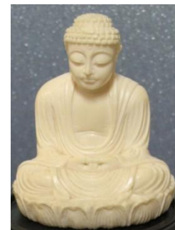
Miniature carved image of Buddha. Ivory.