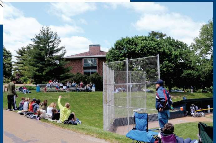
Current baseball seating

If you have questions or would like more information, please call 800.218.7746, ext. 3547.